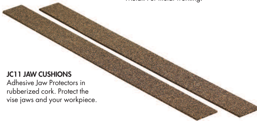
JC11 JAW CUSHIONS Adhesive Jaw Protectors in rubberized cork. Protect the vice jaws and your workpiece.