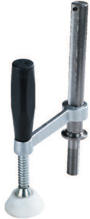
ST11 HOLDFAST Clamps around 360°.