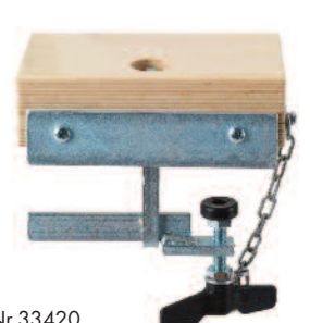
TABLE VISE HOLDER