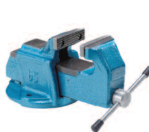
TABLE VISE WITH ANVIL