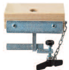
TABLE VISE HOLDER