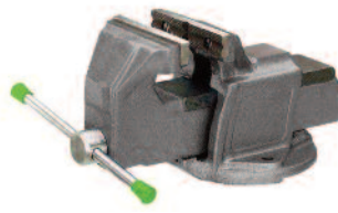
TABLE VISE WITH ANVIL