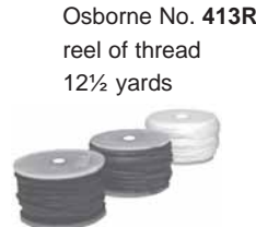
Osborne No. 413R reel of thread 12½ yards