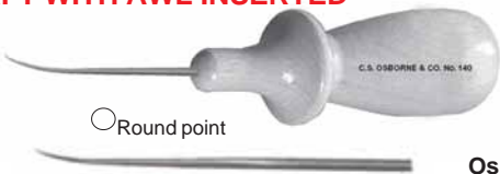
Osborne No. 140