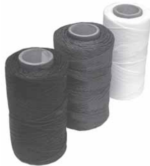
Osborne No. 413ST 1/4 lb. tube of thread 85 yards